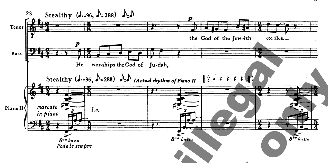
NOTE: This event, which lasts about 15 seconds, is not conducted. At a signal from the conductor, the singers and instrumentalists, synchronizing with the eighth-note pulse of the snare drum, repeat their phrases over and over. At a second signal from the conductor, each finishes the phrase he has begun already and then stops. Each singer may perform the four phrases given in an order of his own choosing. That order should be changed with each repetition. The effect should be of conspirators plotting together stealthily.