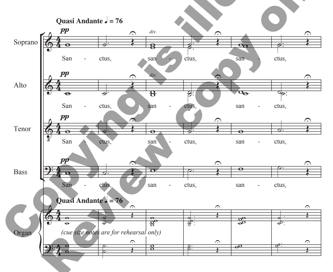
Publisher's Note: This excerpt was created in 2015. The layout and notation differ from the full "Sanctus et Benedictus" that appears in-print in the full score of Missa Brevis (Catalog No. 5829).

© Copyright 2008 by E. C. Schirmer Music Company. A division of ECS Publishing, Boston, Massachusetts. All rights reserved. Made in U.S.A.