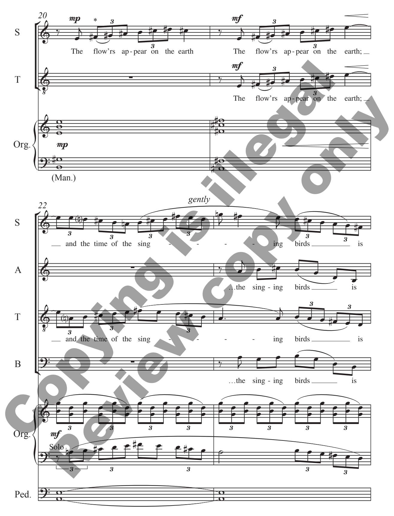
* The word "flow'rs" is pronounced as a single syllable.