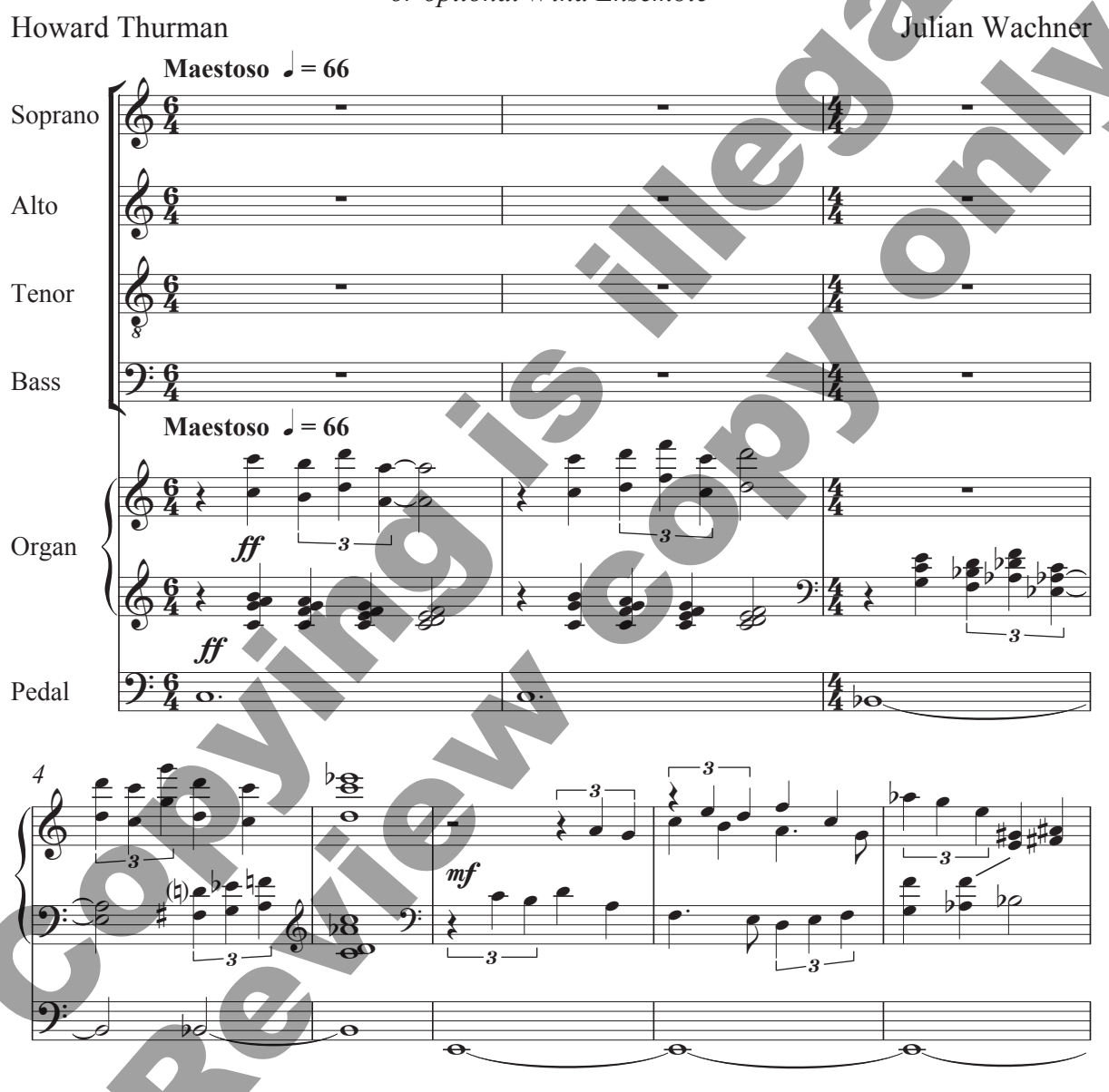
Meditations of the Heart by Howard Thurman Copyright © 1953, 1981 by Anne Thurman. Reprinted by permission of Beacon Press, Boston.

for SATB Chorus and Organ, or optional Brass Quintet, Bass Drum and Organ, or optional Wind Ensemble