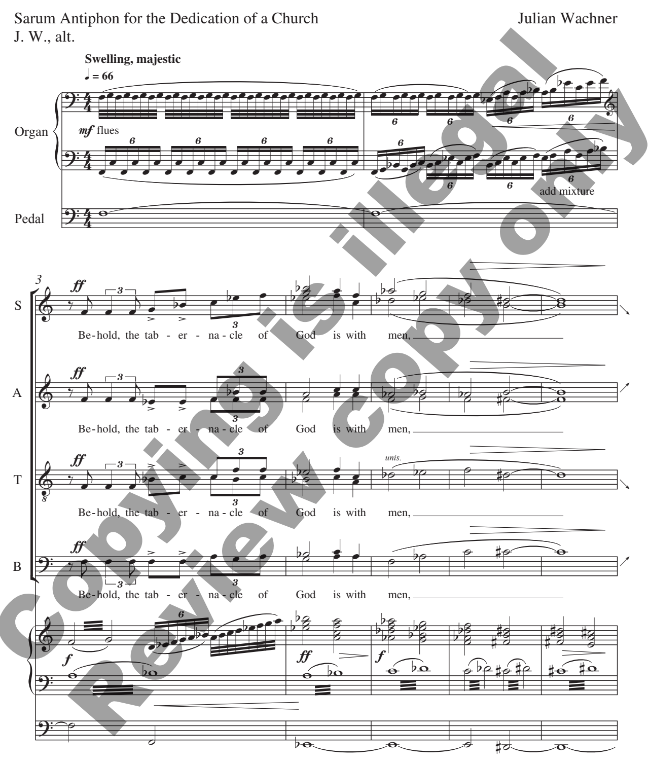
Suggested use: Dedications, Reformation, General.

© Copyright 2007 by E. C. Schirmer Music Company, Inc., a division of ECS Publishing. www.ecspublishing.com All rights reserved.