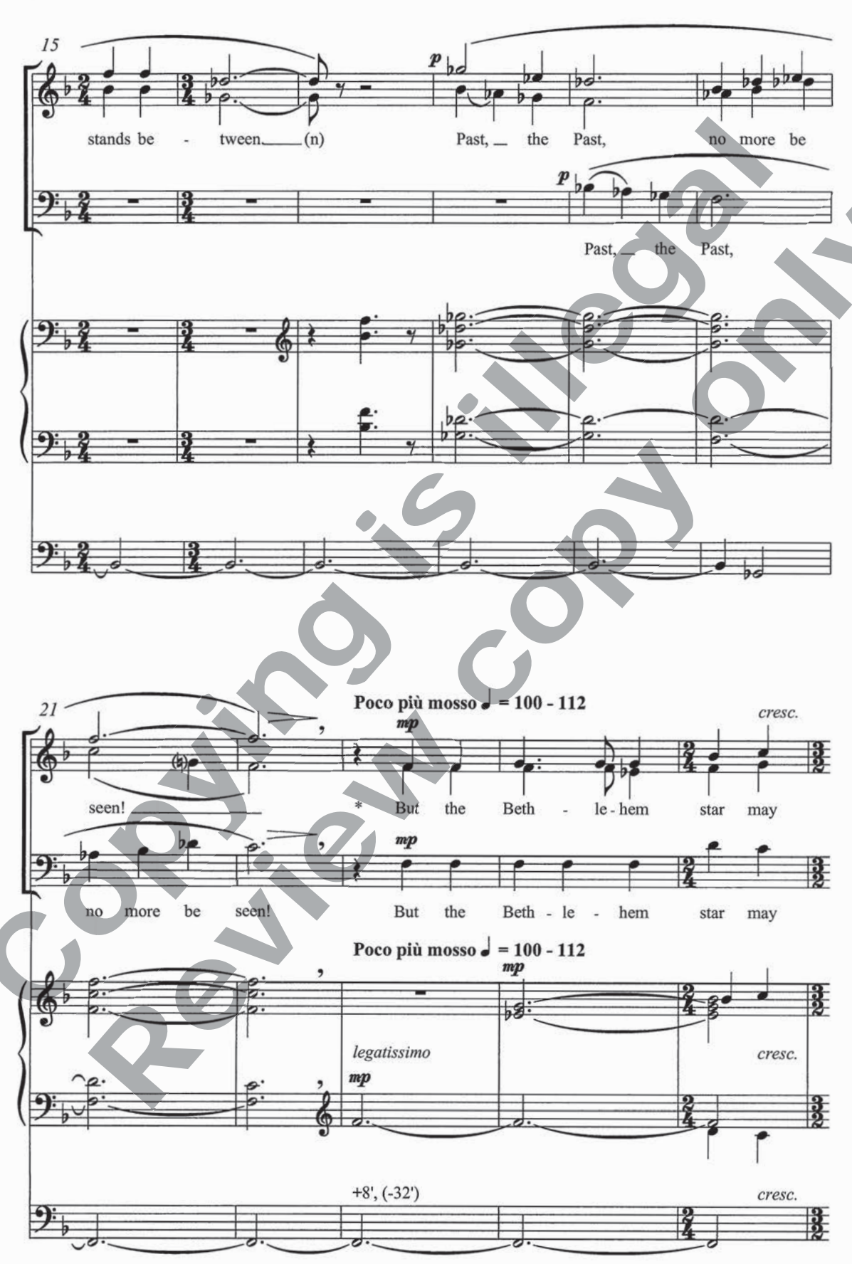
* Mm. 23 - 30 must be sung in one phrase through staggered breathing (mm. 23 - 28 for B).