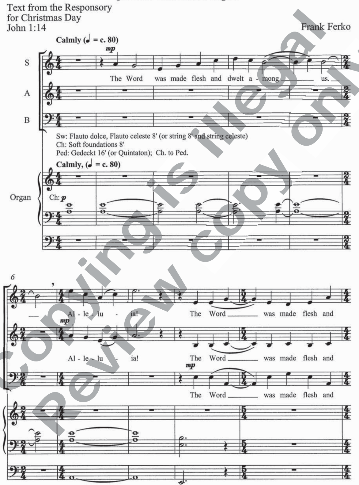
© Copyright 1997 by E. C. Schirmer Music Company. A division of ECS Publishing, Boston, Massachusetts. All rights reserved. Made in the U.S.A.

(Verbum caro factus est) for SAB Chorus and Organ