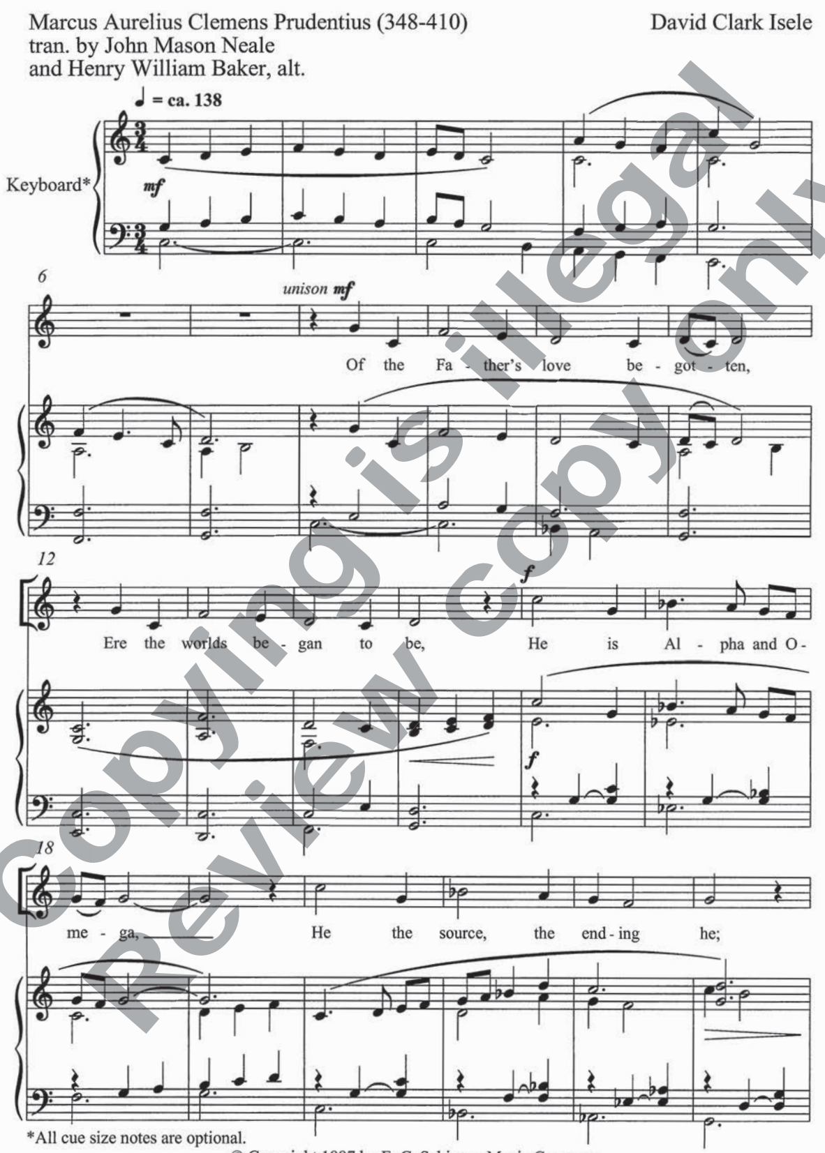
© Copyright 1997 by E. C. Schirmer Music Company. A division of ECS Publishing, Boston, Massachusetts. All rights reserved. Made in the U.S.A.